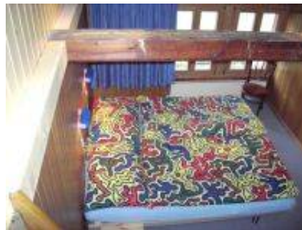
room with doublebed