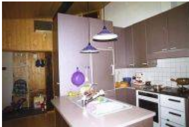
The open kitchen

The kitchen has a Electric stove and oven, refrigerator and dishwasher. The freezer (50lt)is not in the flat.