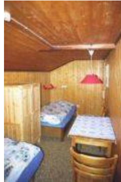
room with two beds